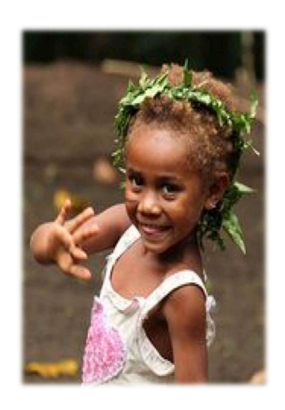
Guide to Planning Learning Experiences: Using the Vanuatu National Curriculum, 2013